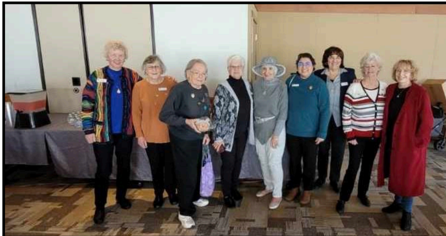
Desert Coast Region, District III held its Winter Workshop on March 2, 2024. The event was hosted by SI Coronado who provided a lovely breakfast and lunch. At right are the participants from SI La Mesa and below are all the Soroptimists attending the informational workshop.