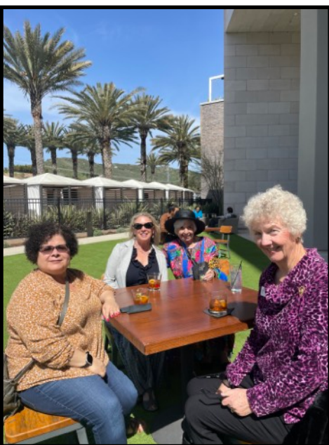
Supporting other Soroptimist Clubs is always fun, educational and fulfilling.